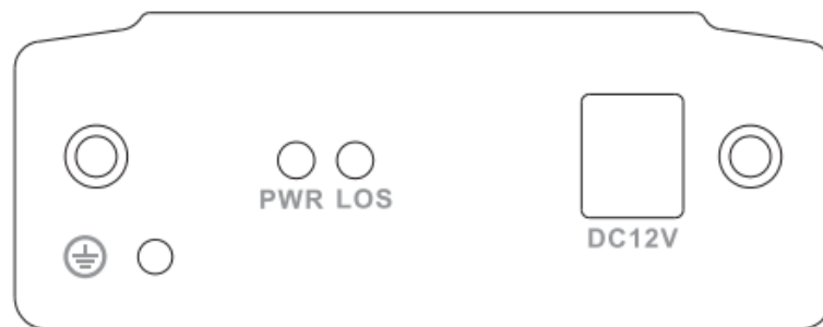
Figure 2- 1

The front panel is shown in Figure 2- 1.